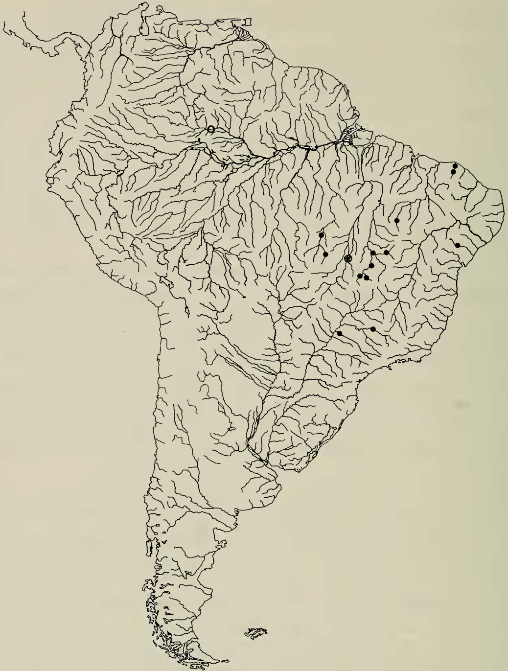
Fig. 4. Distribution of Aspidoras based upon Nijssen and Isbrücker (1976:130, Figs. 20–21), with the addition of the Rio Negro locality reported here for A. pauciradiatus . Circle enclosing star represents type locality of A. pauciradiatus , black circle represents Rio Negro locality of same, and black dots represent localities of other species of Aspidoras .

it was believed never to have occupied the main Amazon basin (Nijssen and Isbrücker, 1976). Conversely, Corydoras was known to be widely distributed in the Orinoco and Amazon basins, the Guianas, the eastern highlands of Brazil, many of the eastern coastal streams of Brazil, and the Paraná basin in Paraguay (Fig. 5). On the basis of these ostensible differences in distribution, Nijssen and Isbrücker (1976) concluded that Corydoras might be more advanced than Aspidoras if the presumptive ancestor of both gen-